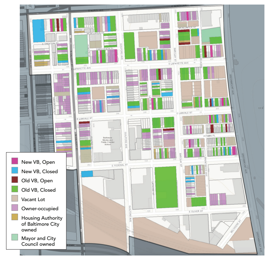
Figure 2 Greenmount West Community Development Cluster in the Midtown Community Statistical Area (June 2019).

Due to the high vacancy rate in Greenmount West at the time, V2V was critical in driving the new market-rate development. Strengths in the arts and entertainment districts surrounding Greenmount West were also important, along with the Baltimore Pennsylvania Station adjacent to this community. Especially notable was the level of readiness and collective efforts of stakeholders in Greenmount West, who enabled joint decision-making and V2V's success in restoring vacant properties. As a result of this productive revitalization, the number of vacant properties in Greenmount West dropped by nearly 70 percent from 2009 to 2016 with few remaining vacant properties today (Figure 2).